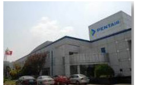
Pentair of Suzhou, China