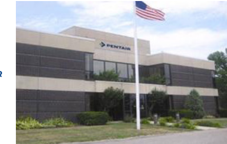
Pentair of Dover, US

Our filtration systems and components are made in 3 different locations each one having its own specialty. Pentair in Dover is dedicated to our well known Fibredyne cartridges. Our manufacturing site in Suzhou is the center of expertise for meltblown but also RO membranes and systems as well as ultrafiltration systems. Pentair Reynosa in Mexico mainly focuses on housings. Pentair Suzhou and Reynosa are ISO 9001:2008 certified