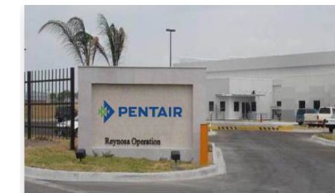
Pentair of Reynosa, Mexico